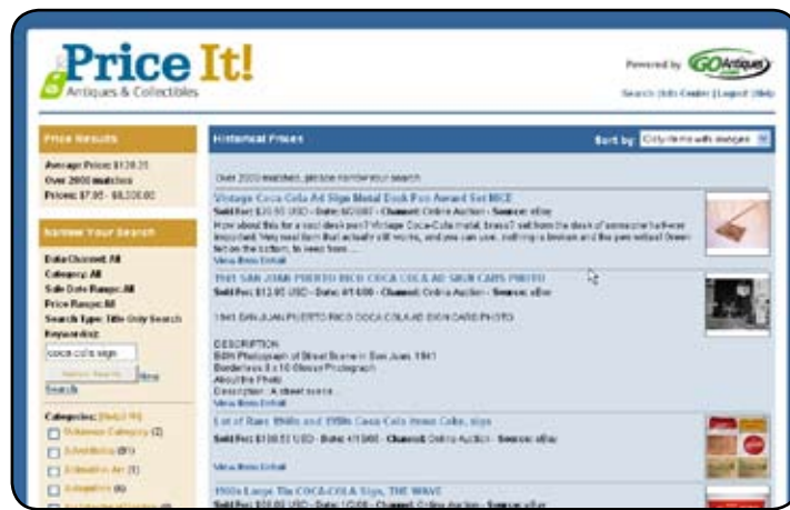
▲ Images returned with results help users see the items they’re researching.